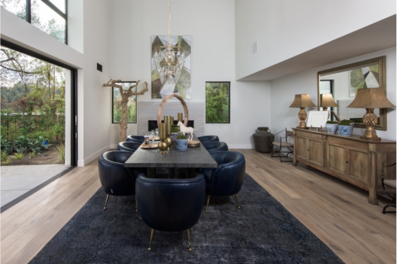
What We Love: The serene and uniform palette of pale oak and white walls throughout the house, a well-considered venue for luxurious family living and serious (or not so serious) entertaining. Plus the aforementioned master suite, below. What's not to love?