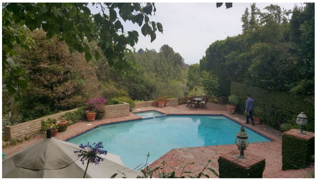
Before: Pool area ANR Signature Collection

The pool area also received a makeover, with a new kitchen/barbecue station and spacious decks.