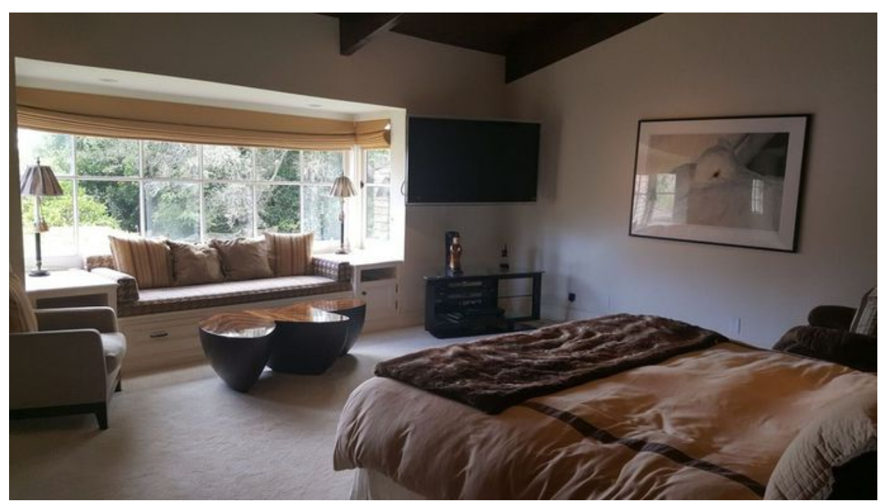
Before: Dark master suite ANR Signature Collection

The second-level master suite was decent but dated. Now, after an expansion and the addition of a cathedral-like wall of windows, it offers greater views, along with substantial style, space, and drama.