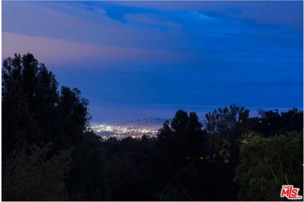
Priceless view

The home's situated on a 30,000-square-foot lot at the end of a cul-de-sac and is surrounded by mature foliage. Another main attraction is the killer canyon and city views right out to Catalina Island.