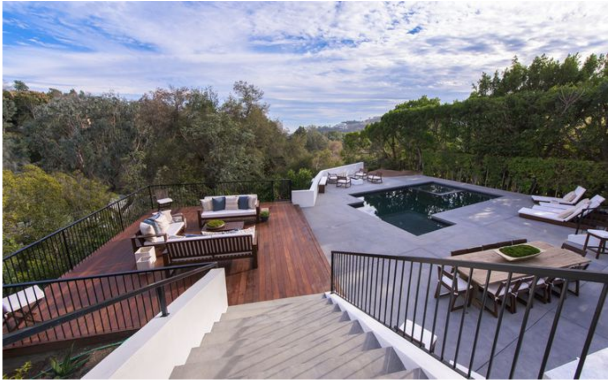
After: New decks and outdoor kitchen

Even the home theater was updated with contemporary equipment and furnishings. We've come a long way since the 1970s.