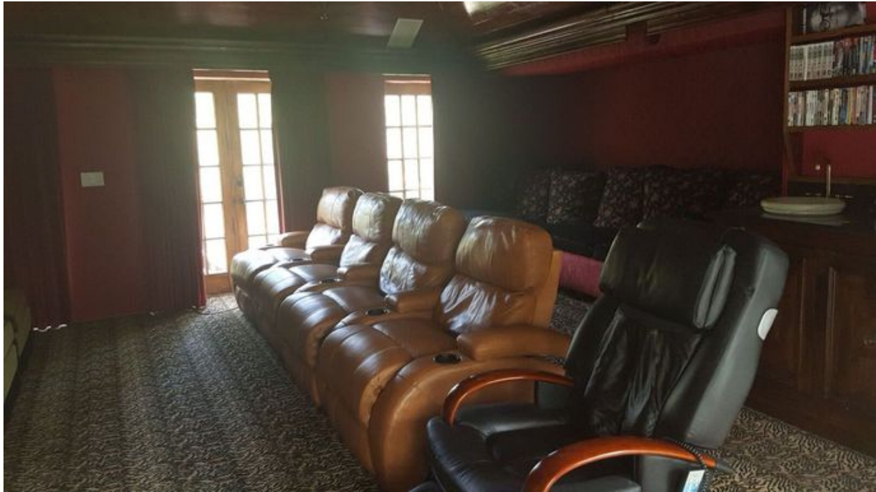
Before: Home theater ANR Signature Collection

Even the home theater was updated with contemporary equipment and furnishings. We've come a long way since the 1970s.