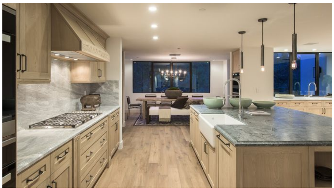
After: Dual islands and a plumbed coffee system Marc Angeles

The same could be said of the master bath—it was in fine shape before. Most buyers would have been completely satisfied with the way it was, but the person who pays $12.5 million for a home wants a master bathroom to be grand and spacious, with luxuries such as spectacular views.