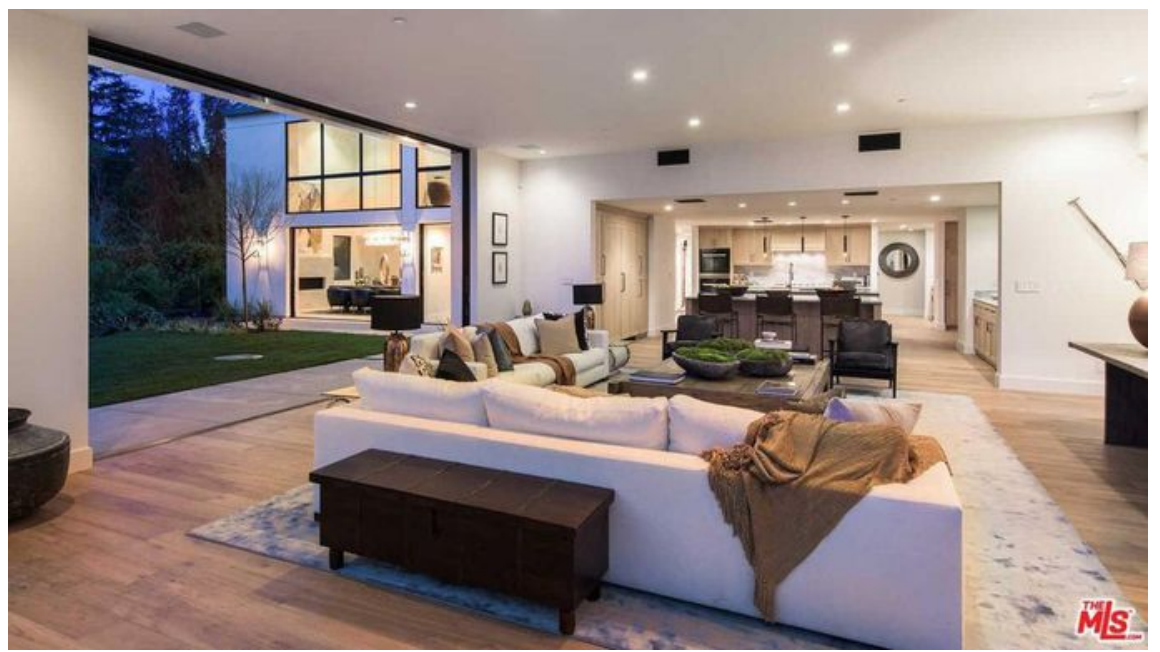
Great room with Fleetwood door realtor.om

The developers also added all-new mechanical, electrical, and plumbing systems, along with designer touches throughout, including wide-plank French oak wood flooring, wood-beamed ceilings, custom light fixtures, wrought-iron wine cellar doors, and a standing-seam metal roof—which serves to create the sophisticated farmhouse feel.