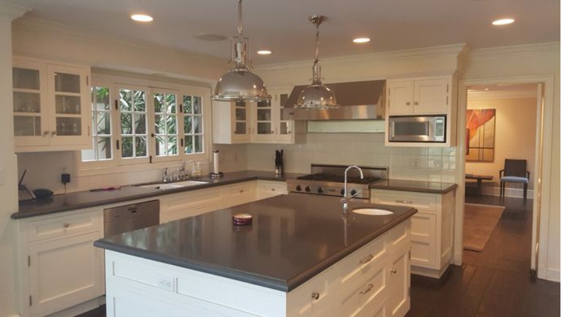
Before: Dated kitchen ANR Signature Collection

The kitchen didn't look awful before, but with the addition of dual islands and Miele appliances, including a plumbed coffee system, it's now state of the art.