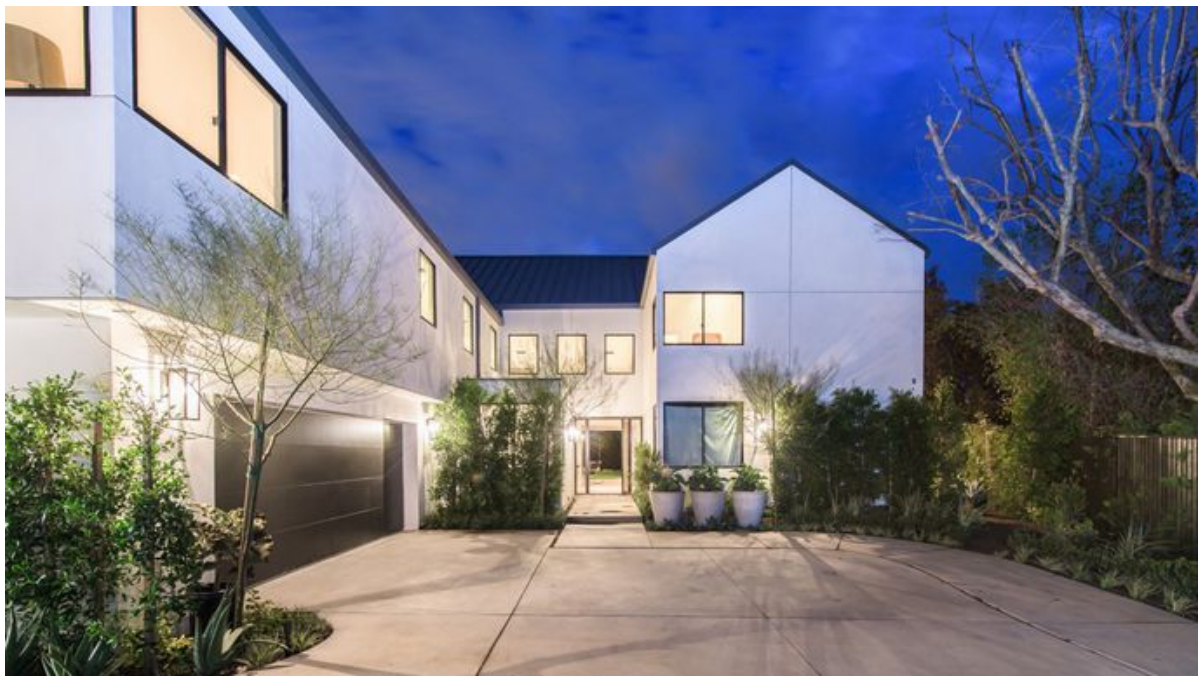
After: Clean lines, neutral palette

The renovation took the home down to the studs. It now has seven bedrooms, eight bathrooms, a home theater, gym, chef's kitchen, butler's pantry, recreation room, two laundry rooms, and a wine cellar.