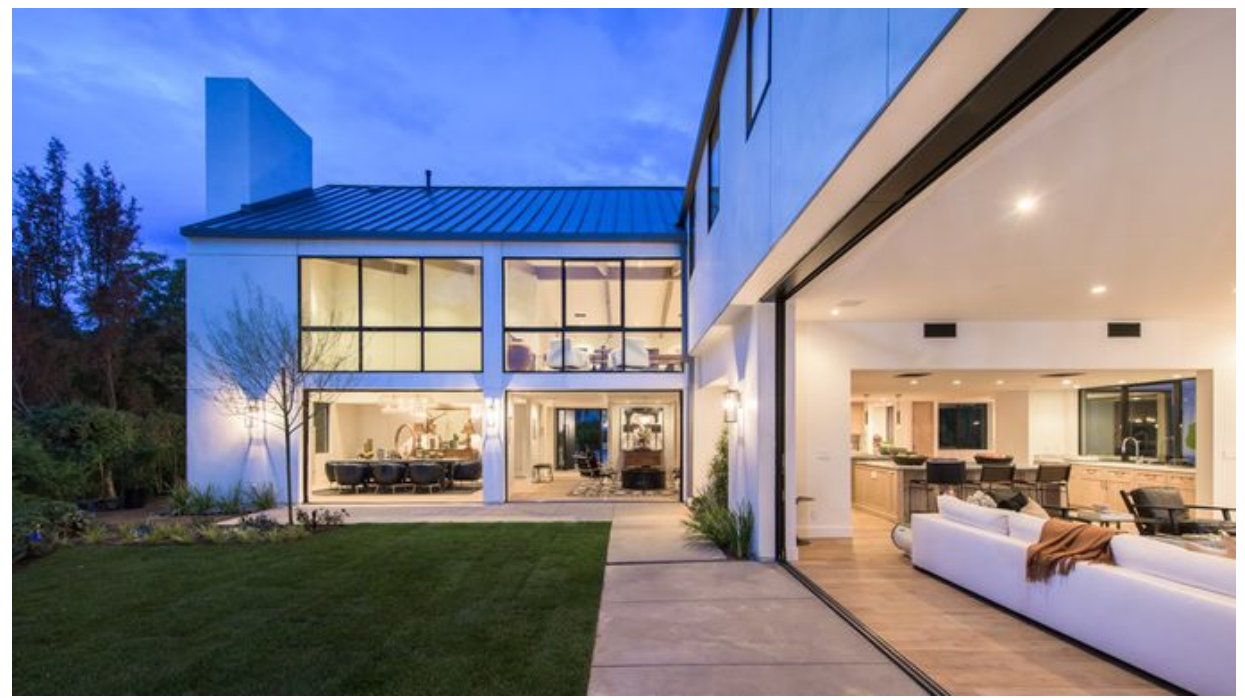
After: Back patio is bright and sunny, and has indoor-outdoor flow. Marc Angeles

The pool area also received a makeover, with a new kitchen/barbecue station and spacious decks.