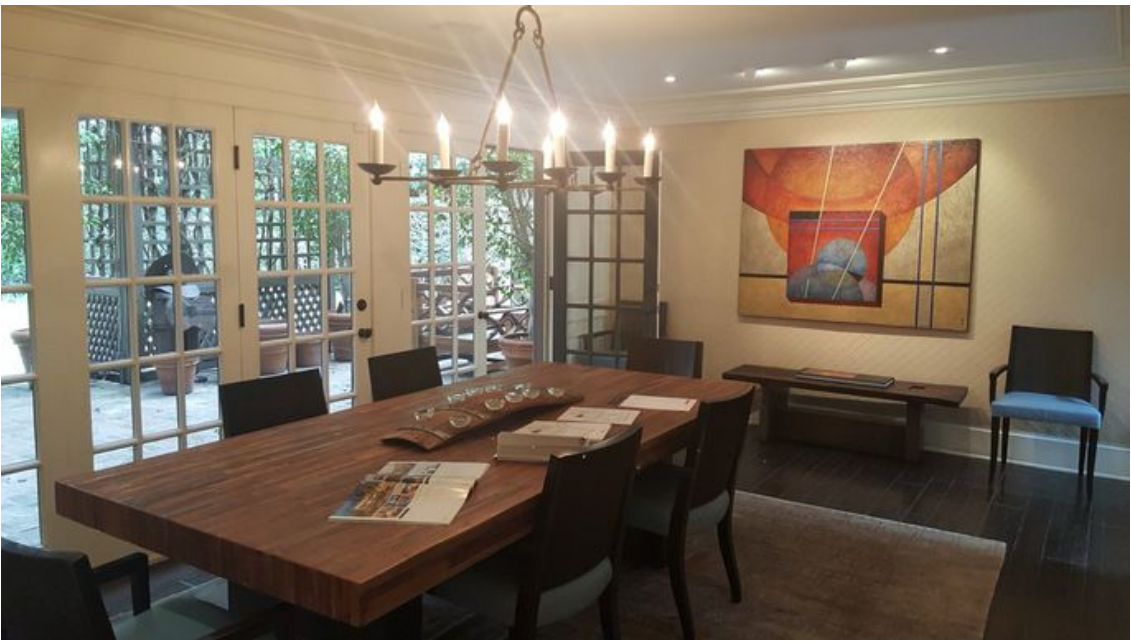
Before: Dining room ANR Signature Collection

Four sets of floor-to-ceiling Fleetwood doors on the ground floor made a major difference in the living/dining room areas. Here's how the dining room was made to look even more delicious: