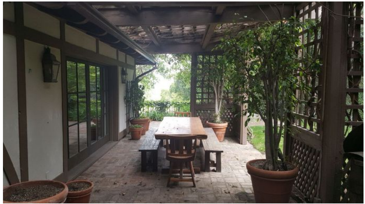
Before: Trellis blocks sunlight on the back patio. ANR Signature Collection

Outside those Fleetwood doors in back, the elimination of dark wooden trellises allows for much nicer (and brighter) indoor-outdoor flow.