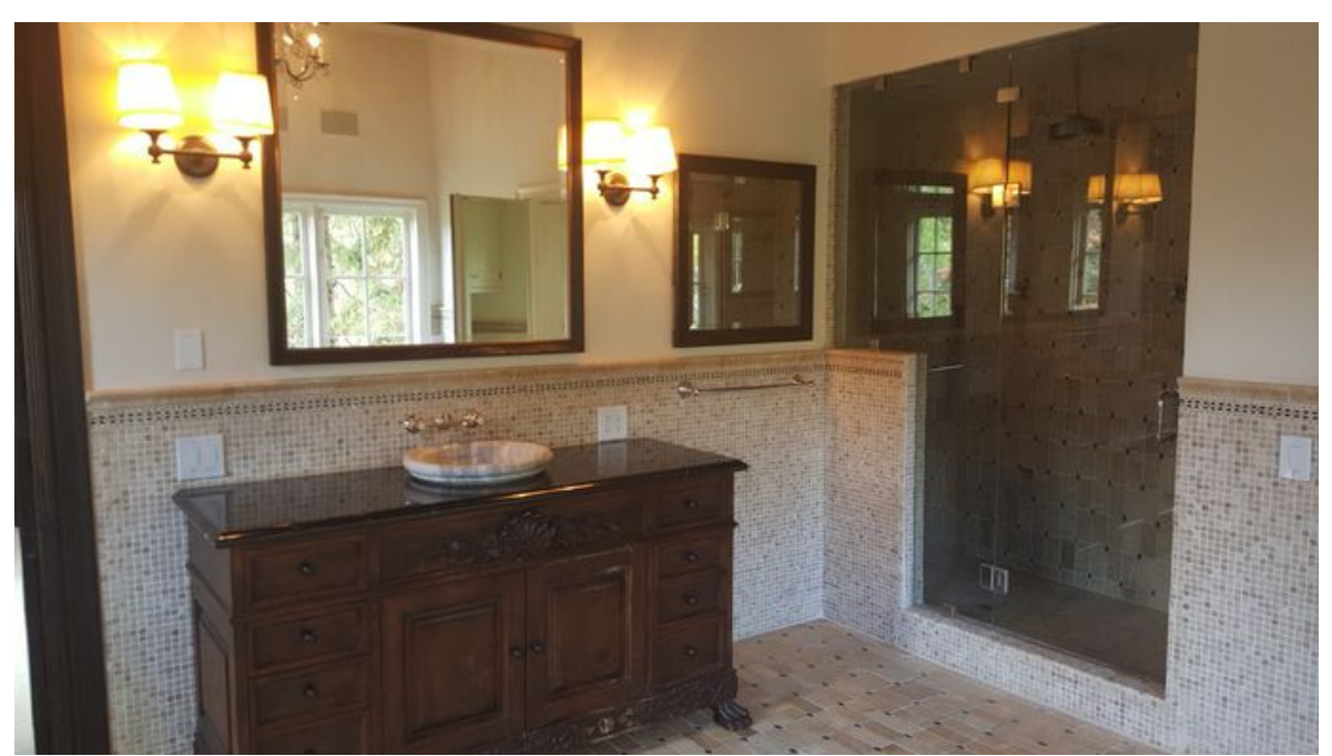
Before: Master bath was perfectly sufficient. ANR Signature Collection

The same could be said of the master bath—it was in fine shape before. Most buyers would have been completely satisfied with the way it was, but the person who pays $12.5 million for a home wants a master bathroom to be grand and spacious, with luxuries such as spectacular views.