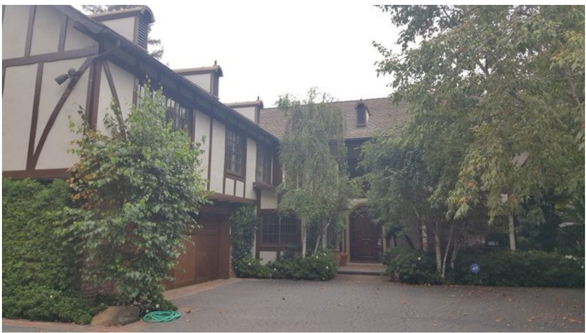
Before: 1970s-era English Tudor ANR Signature Collection