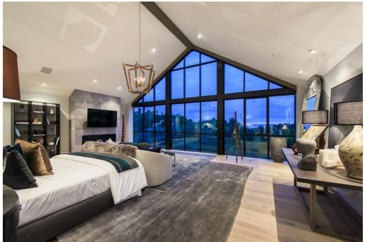
After: Cathedral-like wall of windows in master suite Marc Angeles

Four sets of floor-to-ceiling Fleetwood doors on the ground floor made a major difference in the living/dining room areas. Here's how the dining room was made to look even more delicious: