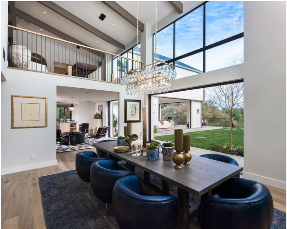
After: Light pours into the dining room. Marc Angeles

Outside those Fleetwood doors in back, the elimination of dark wooden trellises allows for much nicer (and brighter) indoor-outdoor flow.